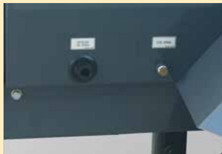
Exterior Drains — Simplify maintenance; the receiver oil, engine oil and fuel drain are independent ports conveniently located on the exterior.