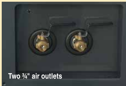
Two 3/4" air outlets