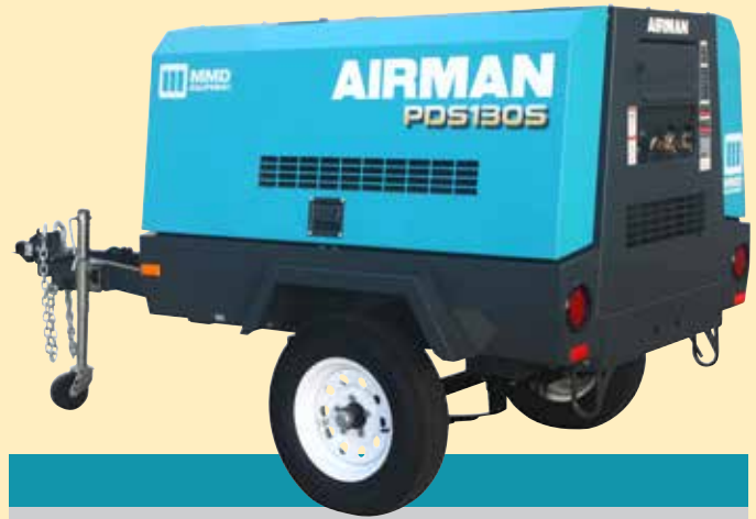
PDS130S-6B4 130 scfm • Tier 4i Shibaura Diesel Engine