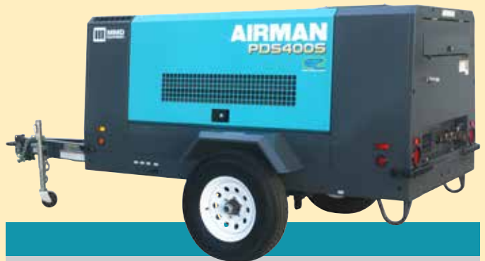
PDS400S-6C3 400 scfm • Tier 3 Flex Isuzu Diesel Engine