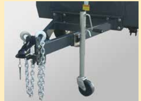
Greater Towing Stability — A wider stance, 14" tires, a re-engineered lower center of gravity, heavy duty leaf springs and a rugged "A" frame draw bar provide even greater strength and stability when towing.