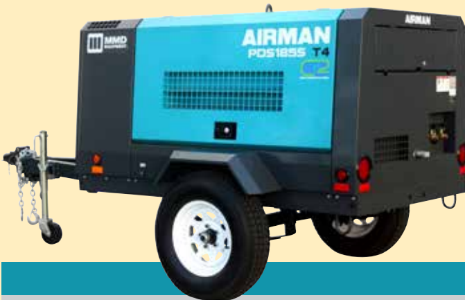
PDS185S-6E1 185 scfm • Tier 4F Yanmar Diesel Engine