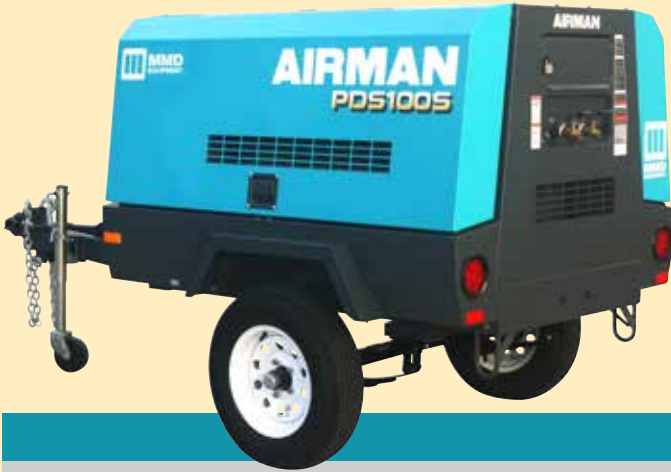
PDS100S-6B4 100 scfm • Tier 4i Shibaura Diesel Engine

A full range of sizes for any application.