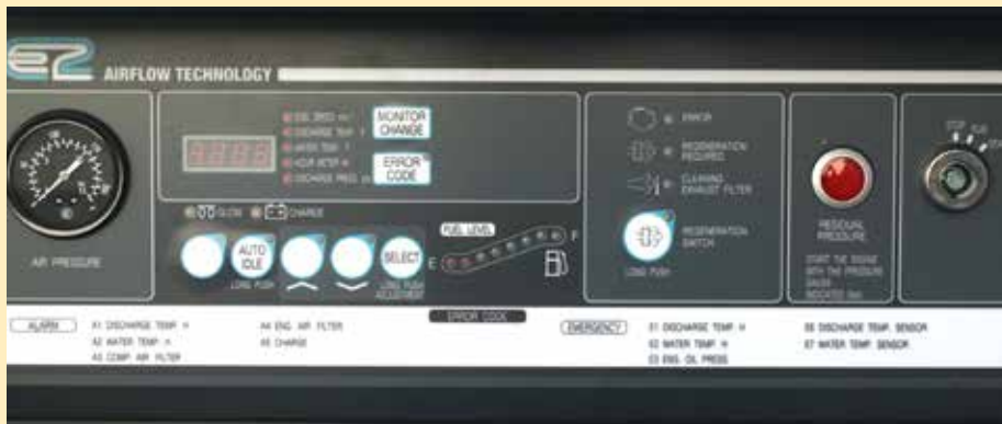
Diagnostic Control Panel — Monitors low fuel level, battery, fuel filter, engine oil filter, water temperature, compressor air filter, oil pressure, discharge air temperature and auto idle.